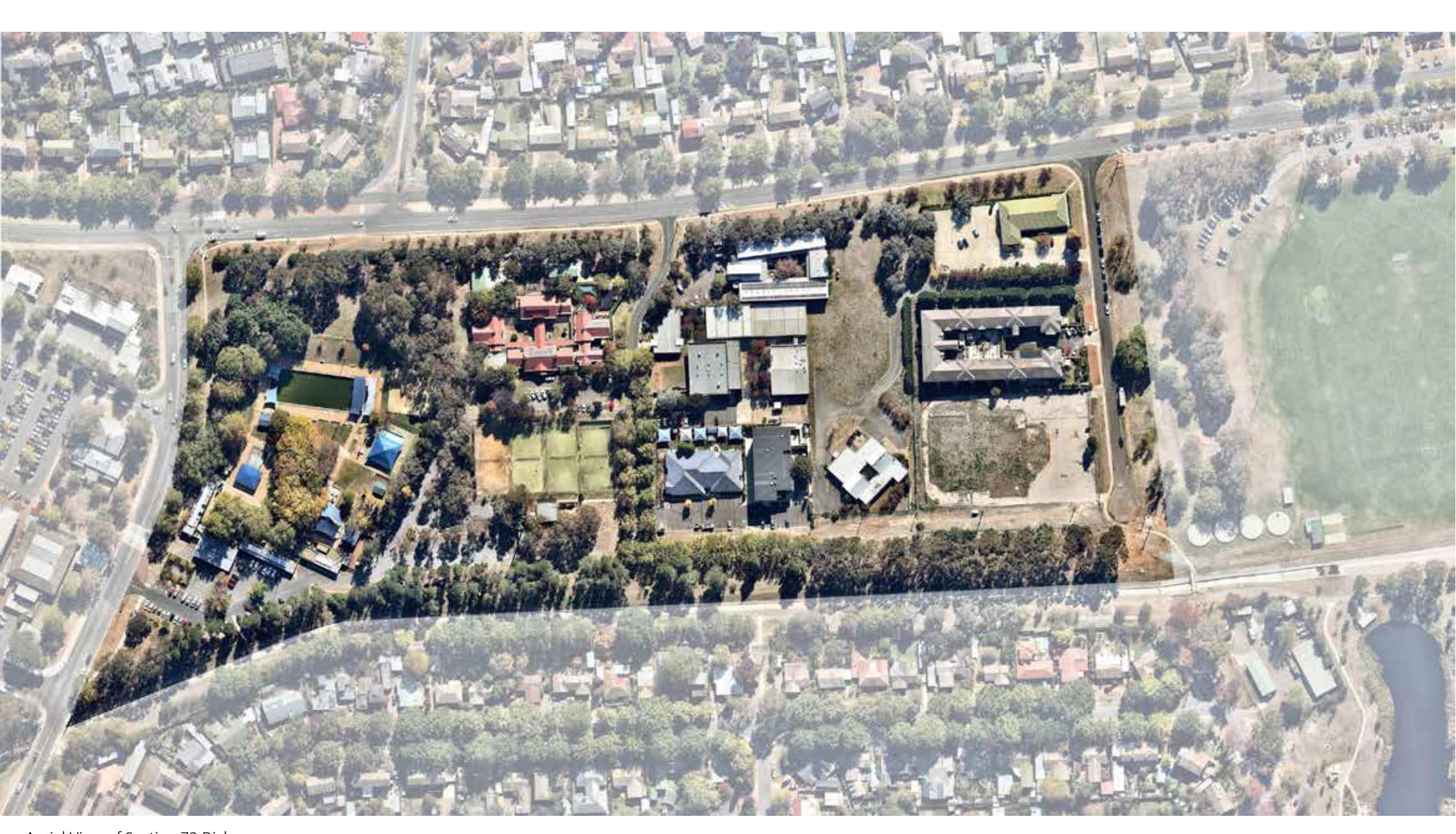
Aerial View of Section 72 Dickson