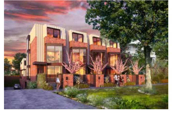
Envisaged articulation of street frontage to Sullivan's Creek