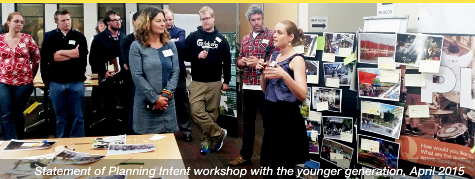
Statement of Planning Intent workshop with the younger generation, April 2015