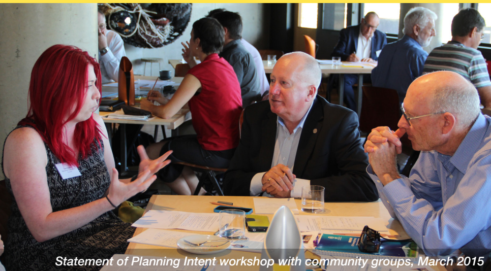
Statement of Planning Intent workshop with community groups, March 2015