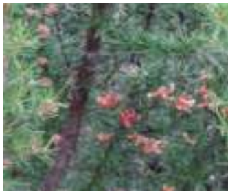
Grevillia - spicky leaves

Bursaria Spinosa Kunzea Ericoides Present in area but will be overgrazed by Kangaroos Present in area but will be overgrazed by Kangaroos