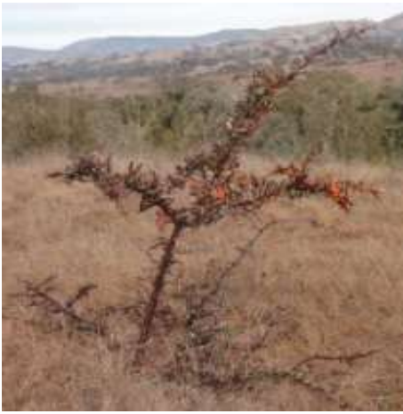
Pyracantha - Firethorn