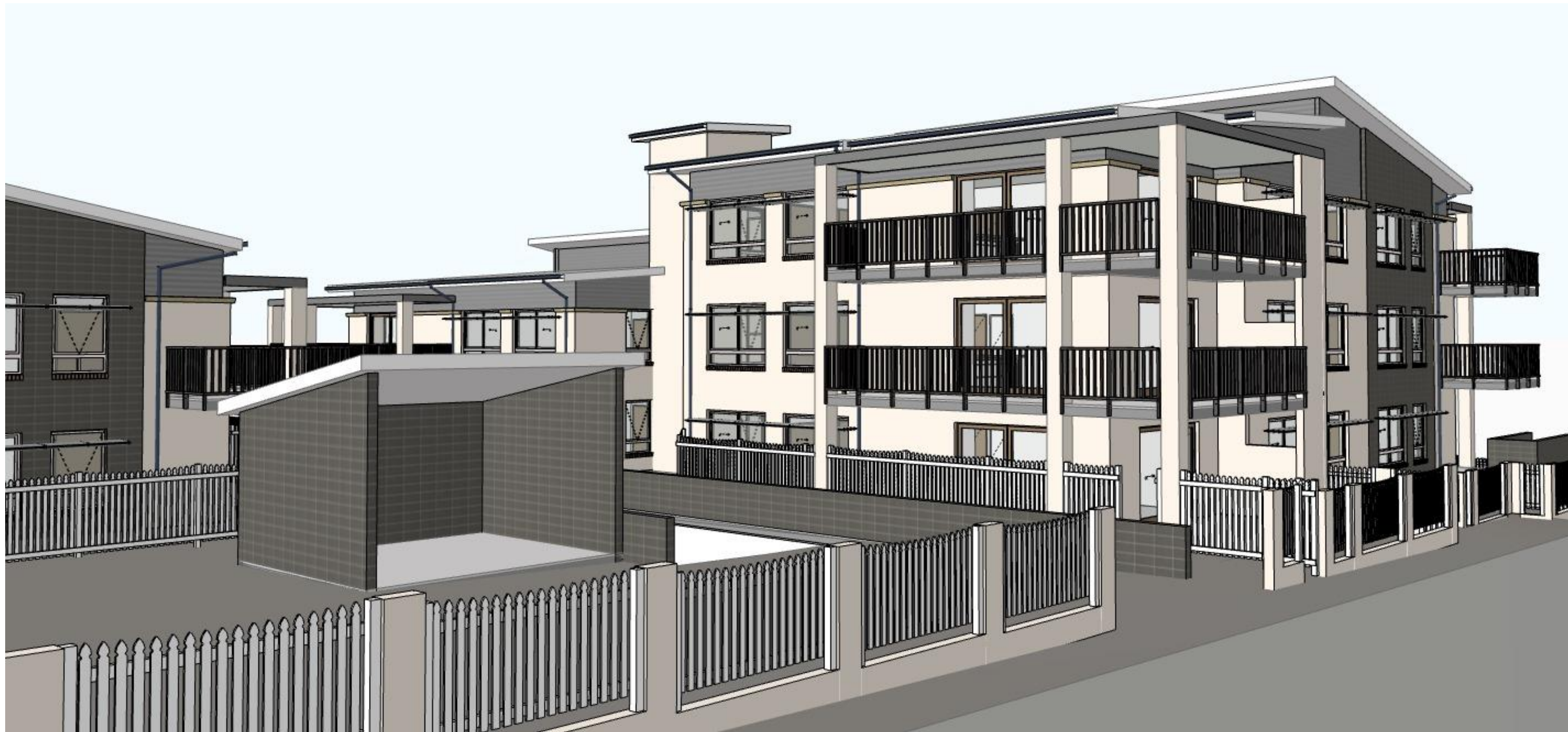
PERSPECTIVE 2 - BUILDING 2