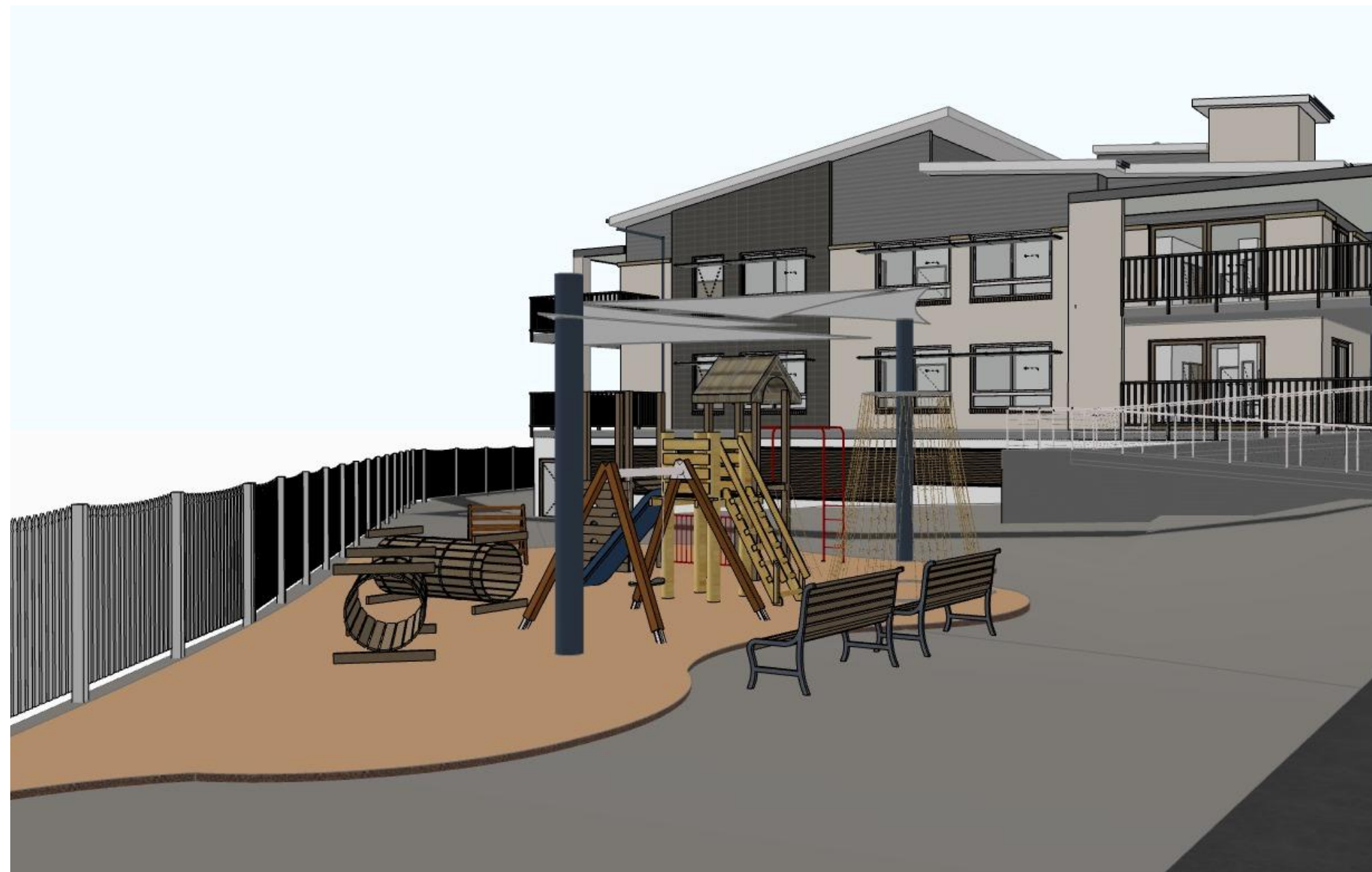
PERSPECTIVE 4 PLAYGROUND