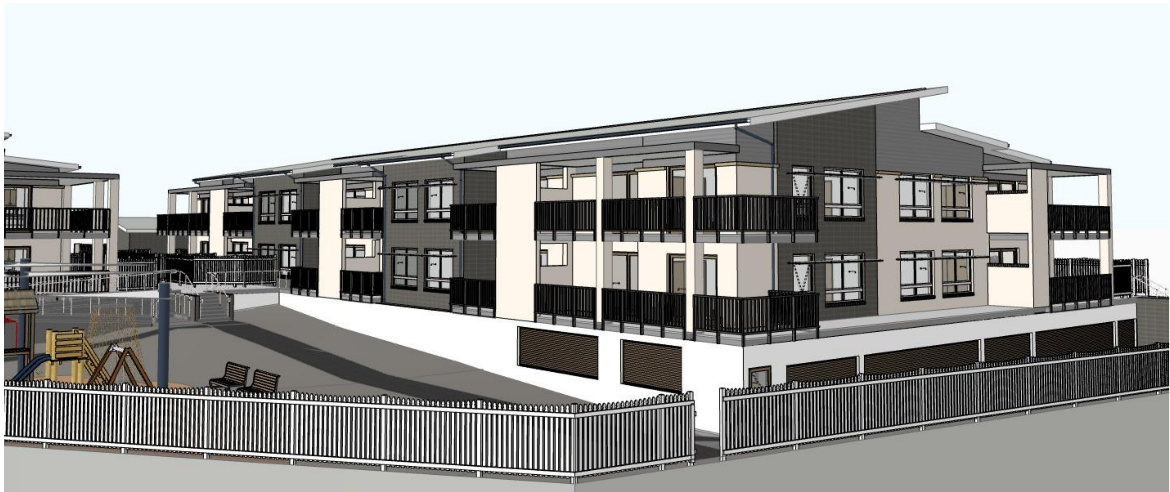
PERSPECTIVE 3 - BUILDING 1