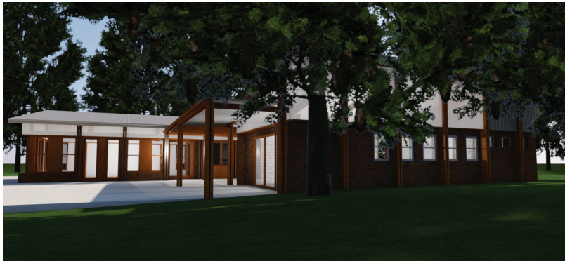
Northern Perspective (From Henty Street)