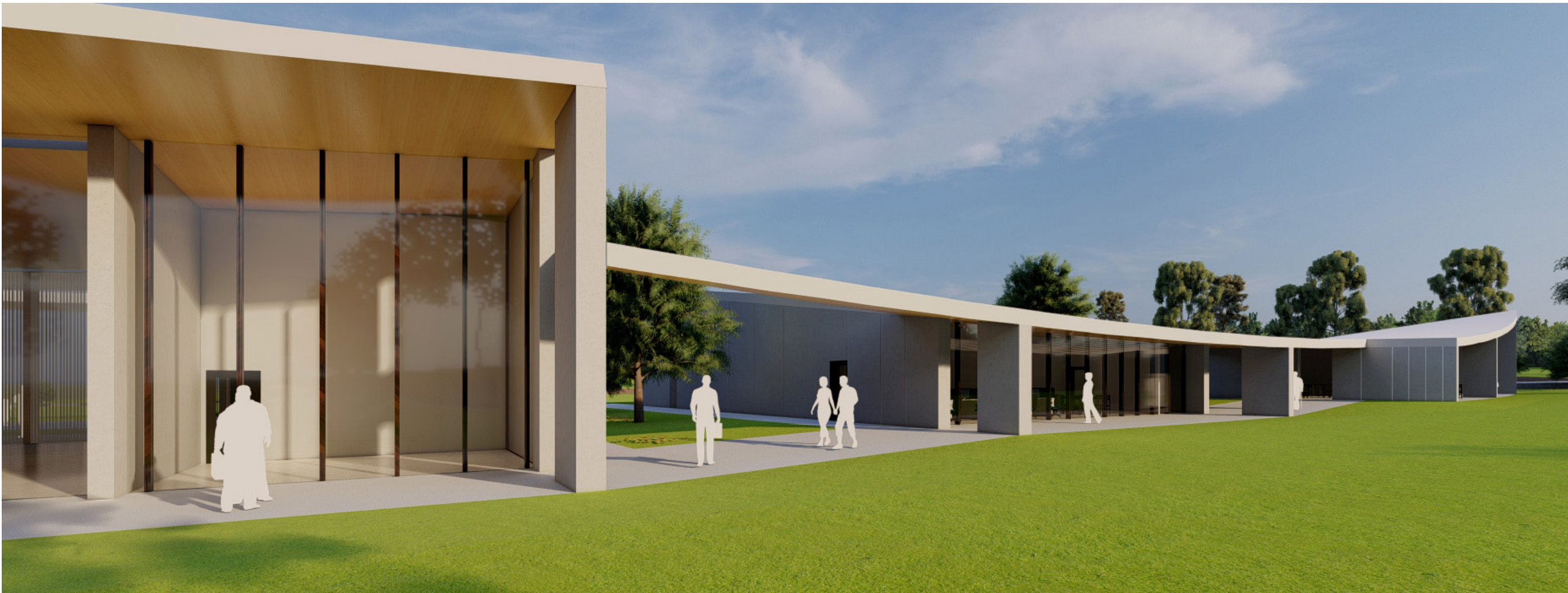
View 3 of covered connection between the Memorial Halls and the Function Halls