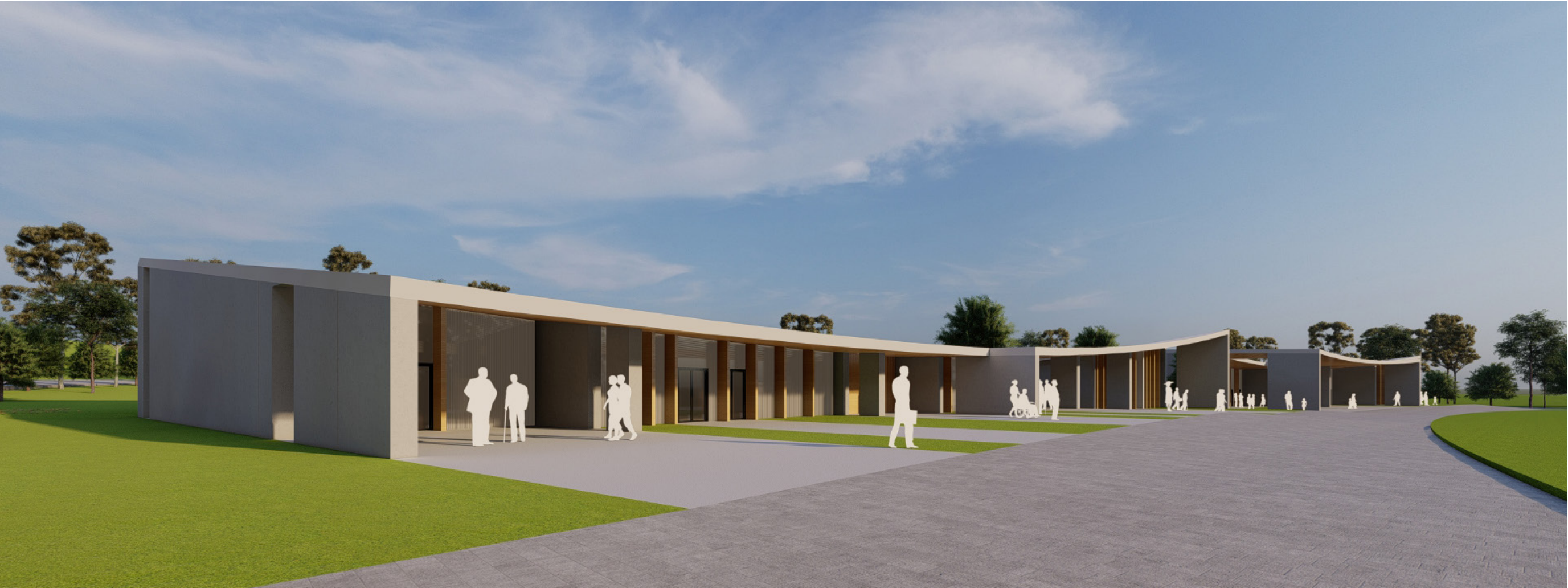
View 2 of Function Halls from the Porte Cochere & Shared Road