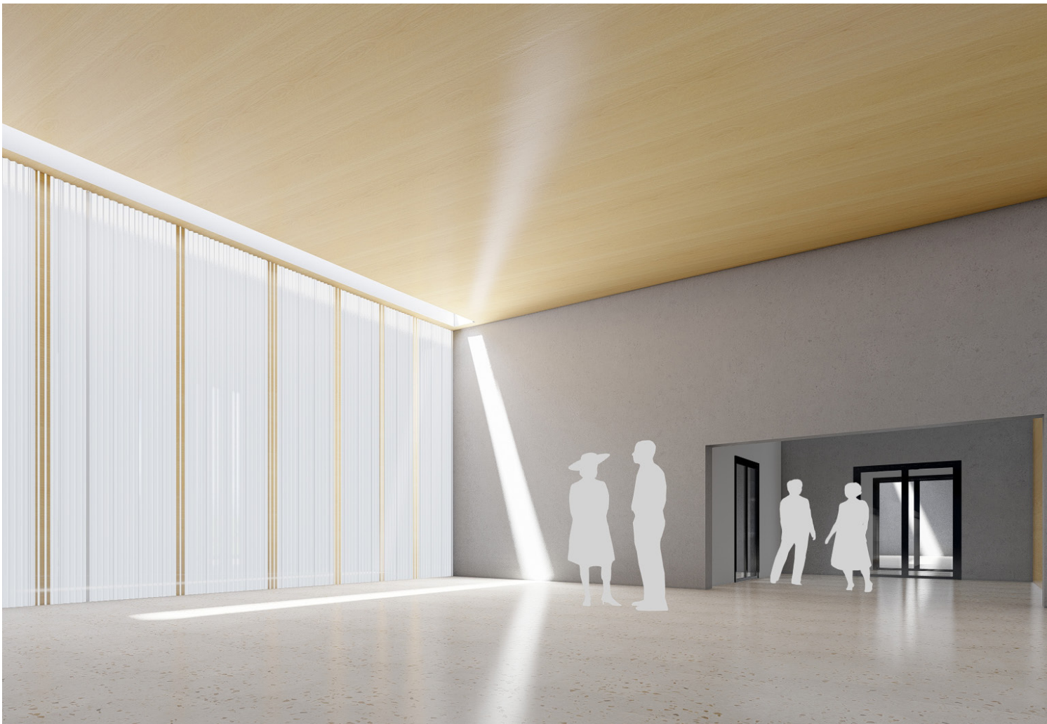
Internal view of a Memorial Hall.