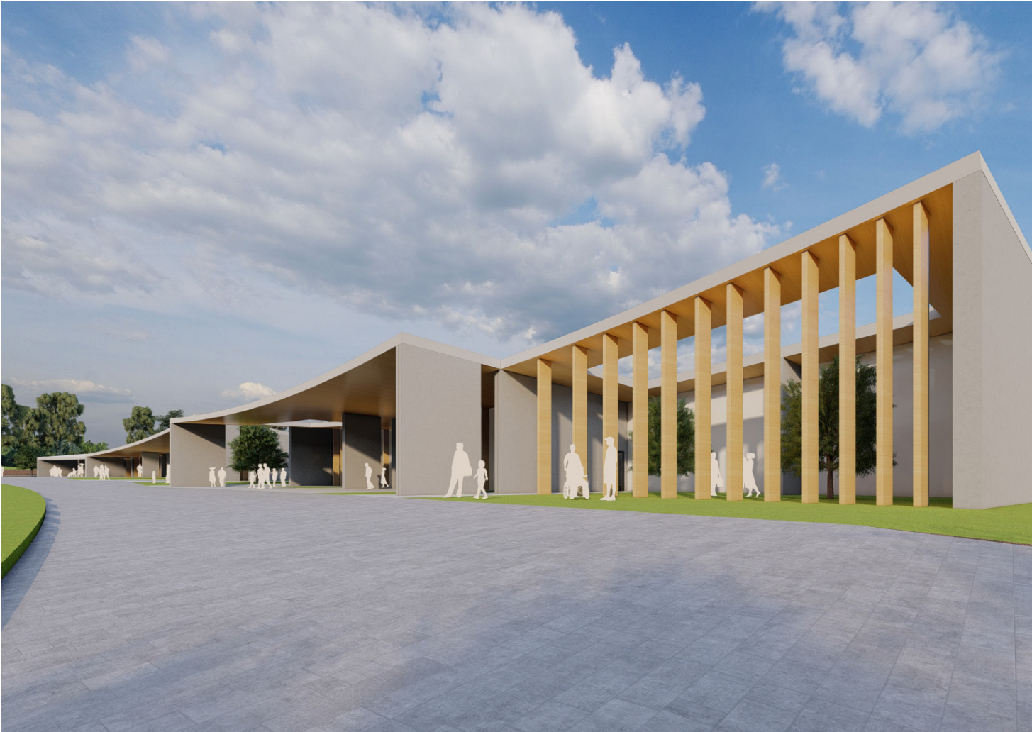
View 1 of Memorial Halls from the Porte Cochere & Shared Road