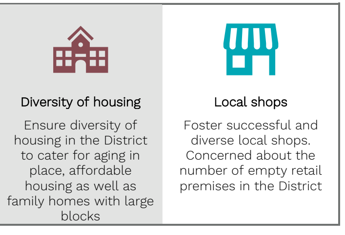
Table 2. Community suggestions on future planning for a diverse district

The most common feedback from workshop participants is summarised in Table 2.