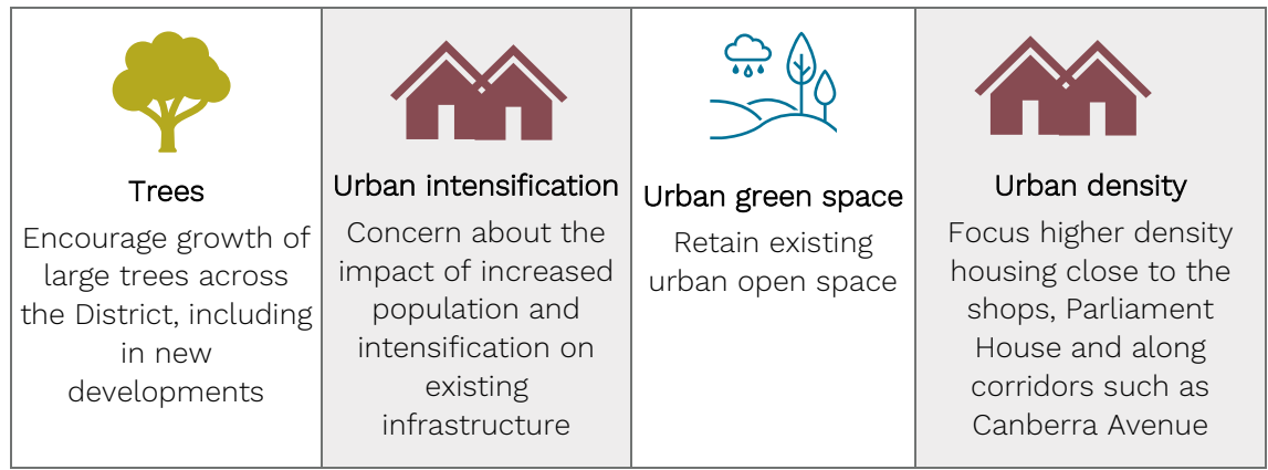
Table 5. Community suggestions on future planning for a sustainable and resilient district

The most common feedback from workshop participants is summarised in Table 5.