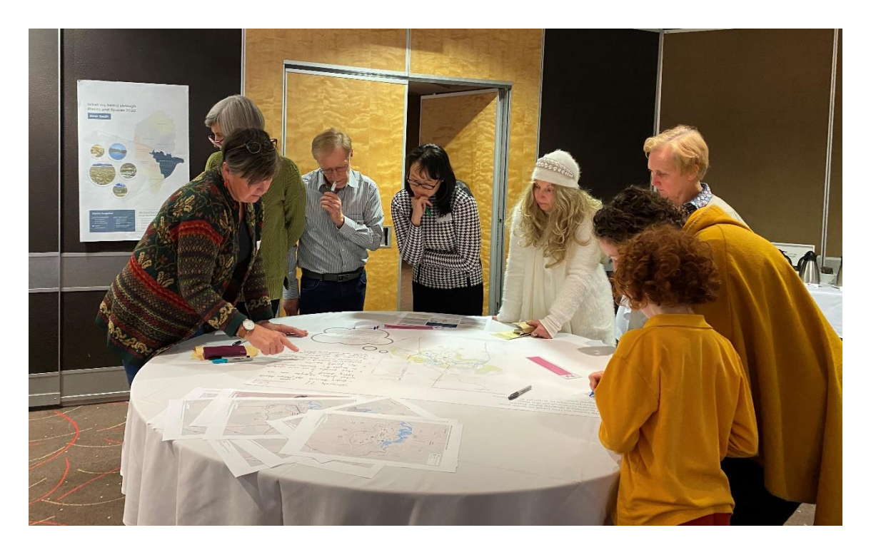
Figure 1. Community members from Inner South during the District Planning Workshop.

This report has been drafted based on a preliminary analysis of the data gathered from participants. An overarching consultation report will be prepared at the conclusion of all district planning workshops. Reporting back to the community on what was heard in the district planning workshops and how that input is informing proposed policy changes will occur later in 2021.