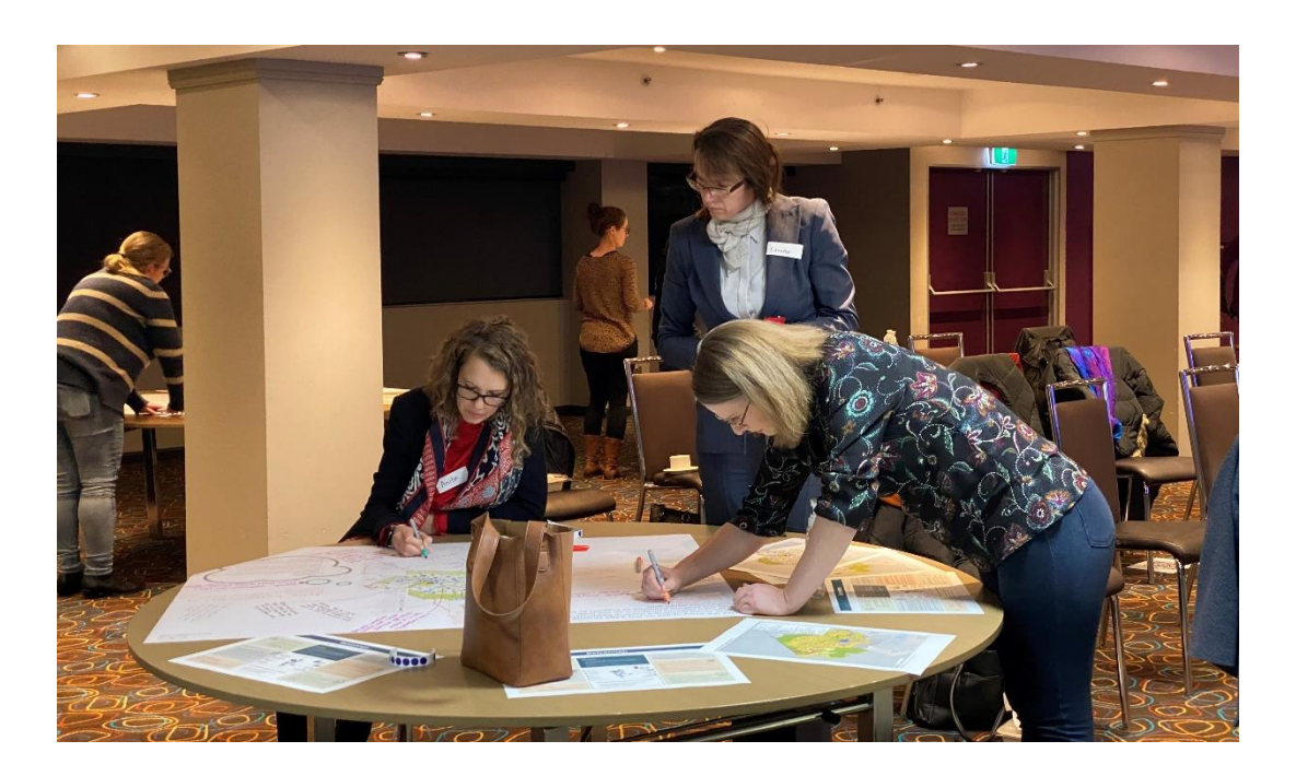
Figure 1. Community members from Belconnen during the District Planning Workshop.

This report has been drafted based on a preliminary analysis of the data gathered from participants. An overarching consultation report will be prepared at the conclusion of all district planning workshops. Reporting back to the community on what was heard in the district planning workshops and how that input is informing proposed policy changes will occur later in 2021.