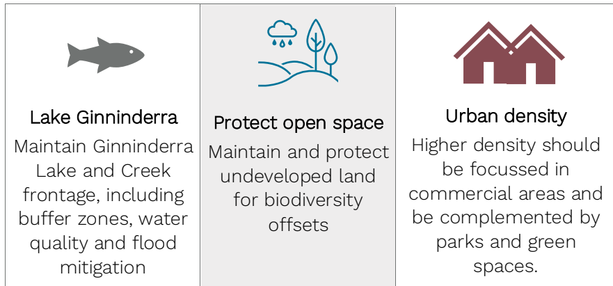
Table 5. Community suggestions on future planning for a sustainable and resilient district

The most common feedback from workshop participants is summarised in Table 5.