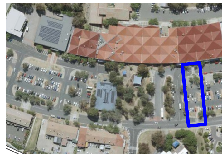
2 Southern Car Park Pedestrian Path Connection