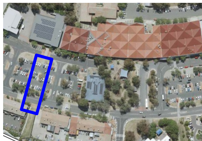
1 Northern Car Park Pedestrian Path Connection