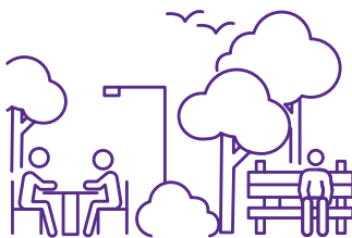
New public places, facilities and green spaces, including public toilets and secure bike storage.