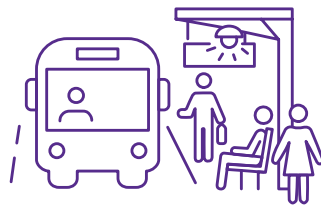
A new light rail ready public transport interchange, with more bus stops and passenger-friendly shelters