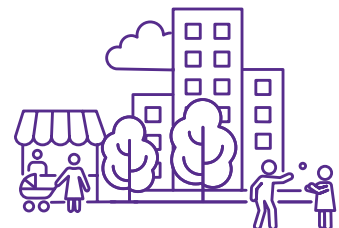
Ground level retail and meeting spaces