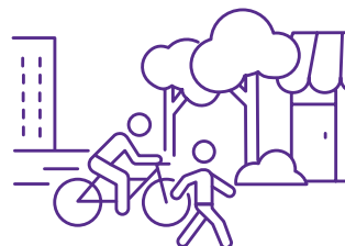
A new pedestrian boulevard linking the interchange to Woden Town Square