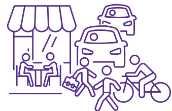
A new local shared zone between Bowes and Bradley streets