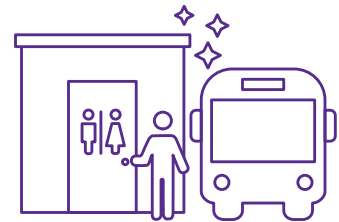
New bus layovers and driver facilities to support the new interchange