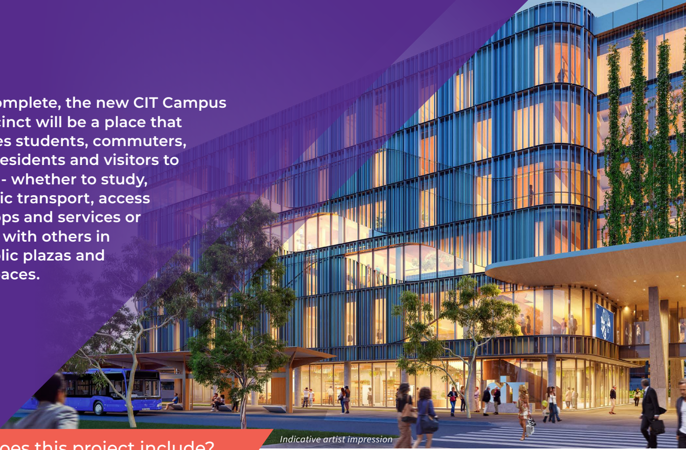
Indicative artist impression

When complete, the new CIT Campus and precinct will be a place that welcomes students, commuters, Woden residents and visitors to the area - whether to study, use public transport, access local shops and services or meet up with others in new public plazas and green spaces.