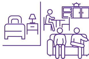
An integrated youth foyer, with up to 20 independent units and communal living spaces