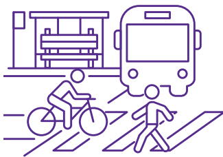
Better pedestrian and active travel connections