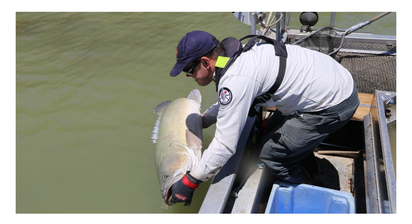
Figure 2. ACT Government research staff monitoring urban lakes fish populations