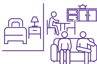
An integrated youth foyer, with up to 20 independent units and communal living spaces