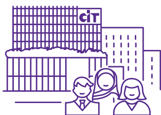
A new purpose-built CIT campus