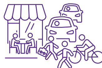
A new local shared zone between Bowes and Bradley streets