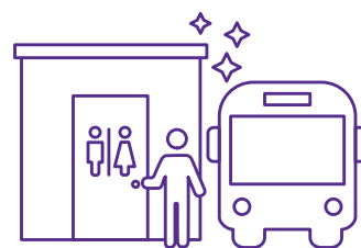
New bus layovers and driver facilities to support the new interchange