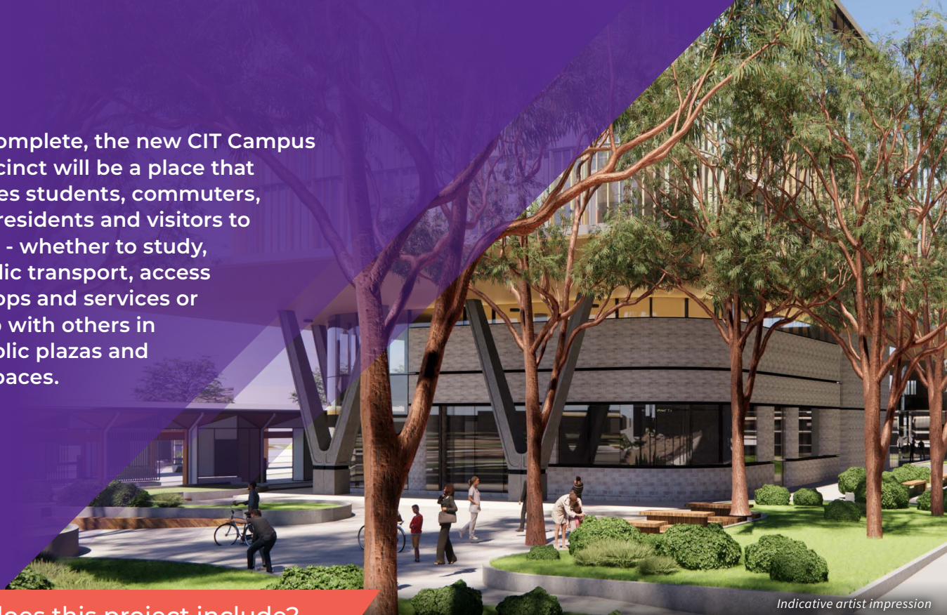
Indicative artist impression

When complete, the new CIT Campus and precinct will be a place that welcomes students, commuters, Woden residents and visitors to the area - whether to study, use public transport, access local shops and services or meet up with others in new public plazas and green spaces.