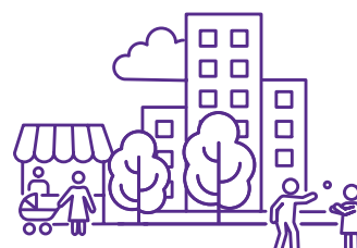
Ground level retail and meeting spaces