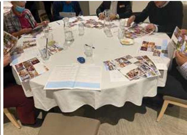
Top left - Future Thinking Panel event, Top right - Community pop-up events Bottom left - Online surveys, Bottom right - Community workshops