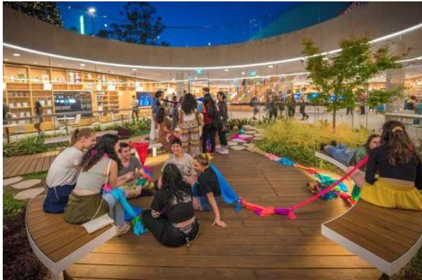
Green Square Library, City of Sydney