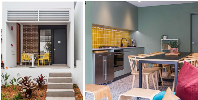
Marrickville Village, build-to-rent, UKO, Image: UKO 4

Housing design incorporates passive cooling and solar access to ensure the indoor climate is comfortable all seasons and maximise energy efficiency. Provide bike parking to encourage active transport.