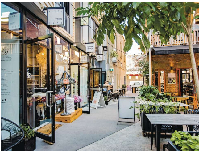
Bakery Lane, Queensland, Image: Queensland.com

Alternative housing models such as co-living and build-to-rent are designed to provide quality shared amenities and ensure the affordability and durability of the building.