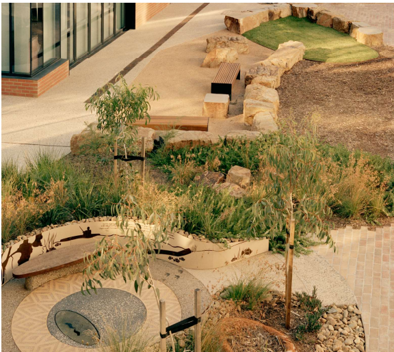
Bendigo Kangan Tafe Redevelopment 1

Water-sensitive urban and native planting are included to strengthen the biodiversity and natural systems. The integration of a network of green and walkways could also provide a pleasant experience to move around the Town Centre.