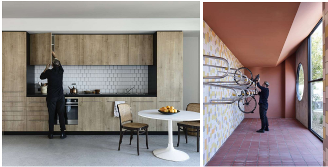
Housing Choice Australia Dandenong, Kennedy Nolan Architects, 3