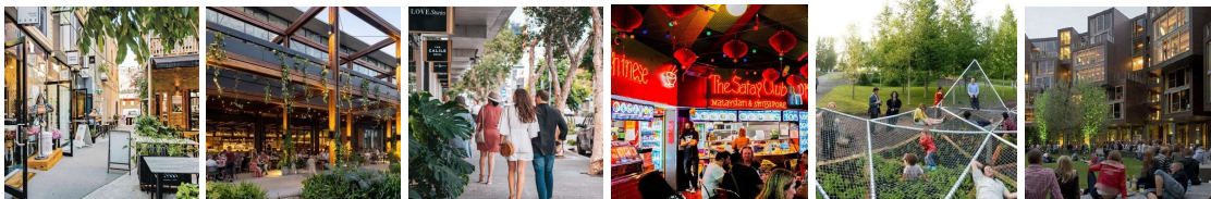
The look, feel and experience the community selected during the engagement program

Curate a retail offer that complements and extends the current town centre offering