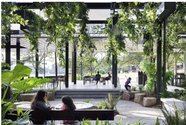
Riverside Green South Bank Parklands