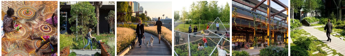
The look, feel and experience the community selected during the engagement program

Deliver a network of green and social streets, laneways and walkways