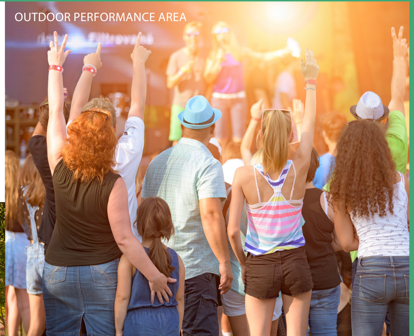
OUTDOOR PERFORMANCE AREA

WHAT WILL YOU WANT TO DO? WHAT IS IMPORTANT TO YOU?