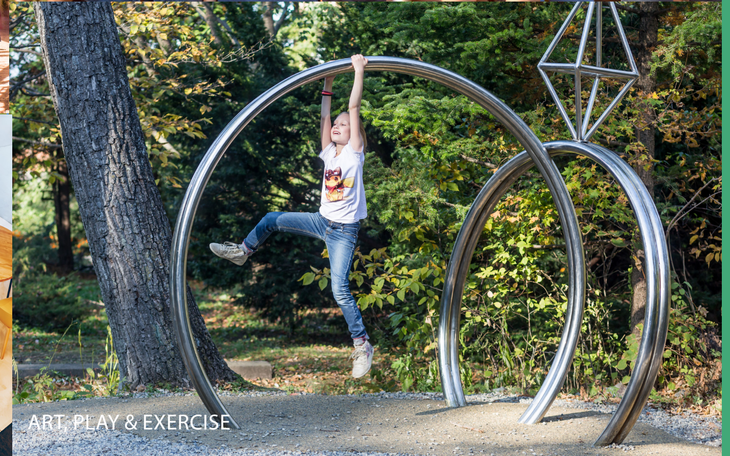
ART, PLAY & EXERCISE