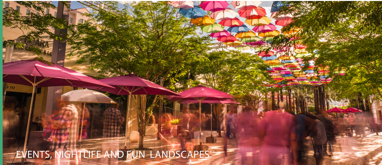
EVENTS, NIGHTLIFE AND FUN LANDSCAPES