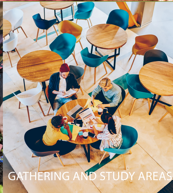
GATHERING AND STUDY AREAS